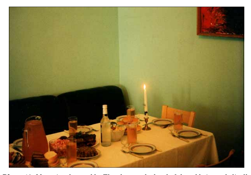
Photo 10. Mourning feast table. The place at the head of the table is symbolically set for the deceased. To mark this and for commemoration, a mourning candle has been lit. Photo by Marju Kõivupuu, 2001.