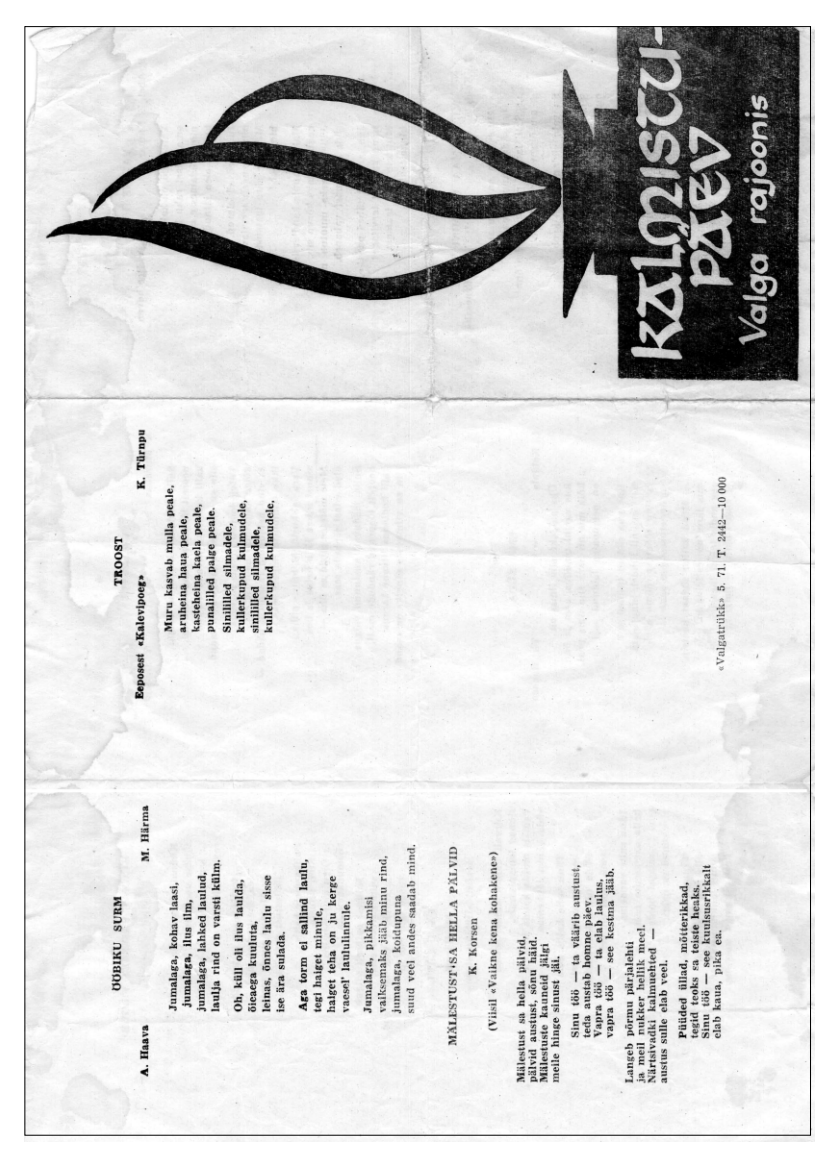
Photo 11. A song leaflet from the 1970s Soviet secular cemetary day.