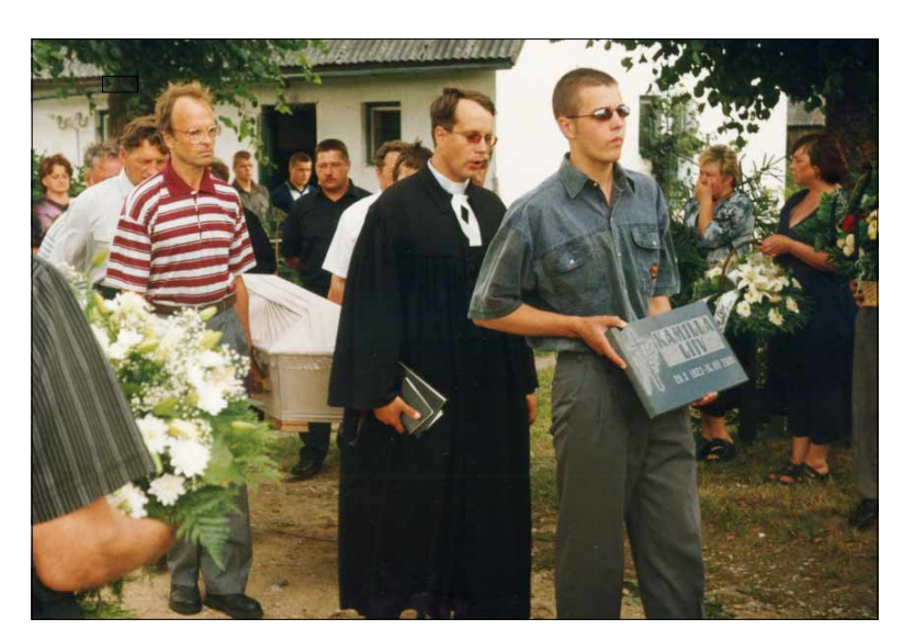
Photo 3. The rite of sending off from home. Hargla parish. Carrying the coffin to the car.