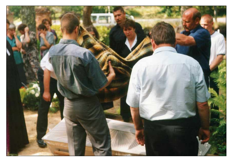
Photo 6. Saying goodbye at the cemetary. Covering the coffin with a home-made woollen blanket. Photo by Marju Kõivupuu, 2001.