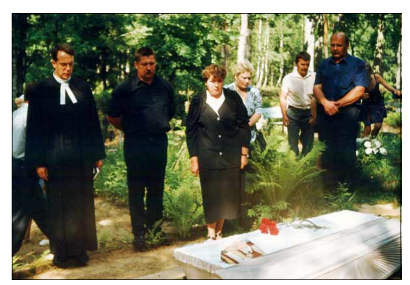
Photo 5. Saying goodbye at the cemetary by the open coffin. Photo by Marju Kõivupuu, 2001.