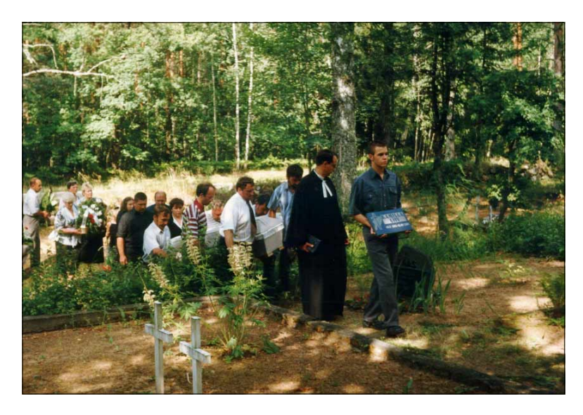
Photo 4. Mourning procession at the cemetary.