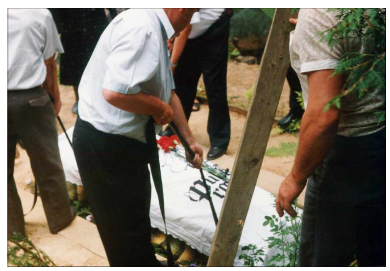
Photo 7. Covering the coffin with a special linen brought from a tradition agency. Relatives lowering the coffin to the grave. Photo by Marju Kõivupuu, 2001.