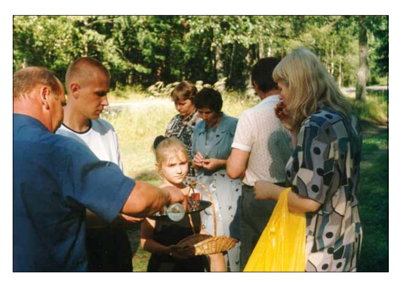
Photo 9. Ritual offering of alcohol and snacks at the cemetary gate after the burial. Photo by Marju Kõivupuu, 2001.