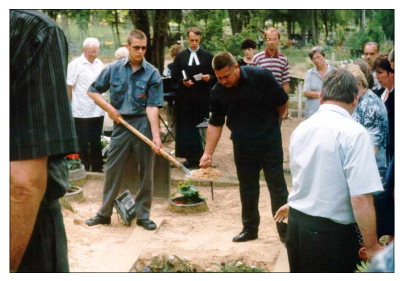
Photo 8. The ritual throwing of three handfuls of soil into the grave. Photo by Marju Kõivupuu, 2001.