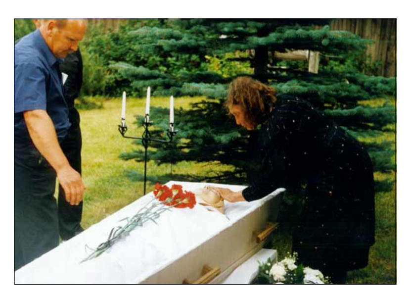
Photo 2. The rite of sending off from home. Hargla parish. Sister saying goodbye to the deceased.